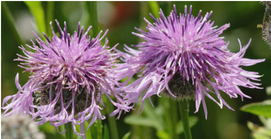
5.00% Centaurea scabiosa – Greater Knapweed