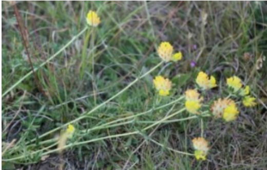
2.00% Anthyllis vulneraria – Kidney Vetch