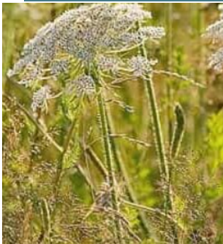
2.00% Daucus carota – Wild Carrot