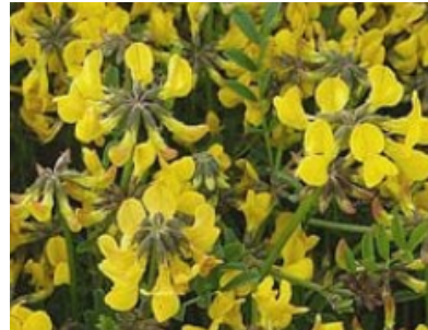
1.00% Hippocrepis comosa – Horseshoe Vetch