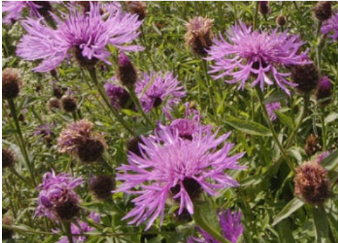
9.00% Centaurea nigra – Common Knapweed