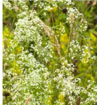
5.00% Galium album – Hedge Bedstraw