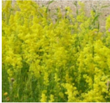
3.00% Galium verum – Lady's Bedstraw