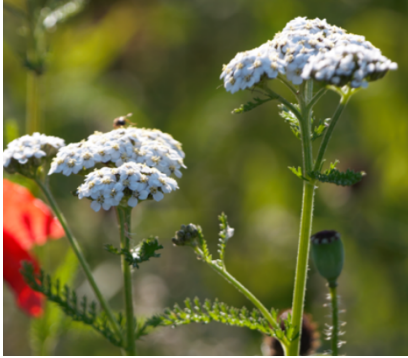
2.50% Achillea millefolium – Yarrow